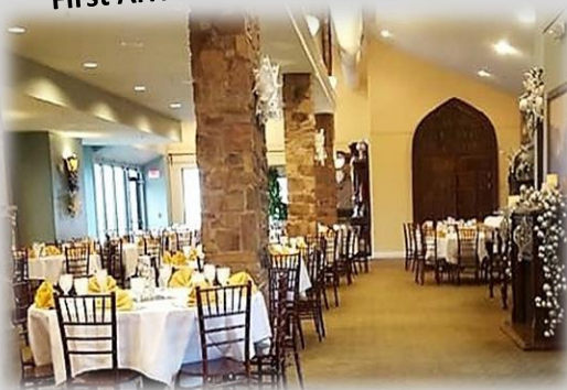
Christmas Dinner Room