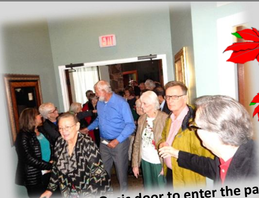
First Arrival at Oasis door to enter the party.