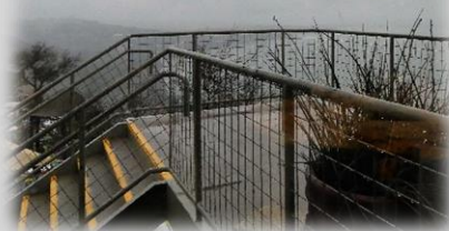
Not to be able to see sunset on Lake Travis due to heavy fog.