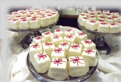
Beautiful Dessert Cake by Simon Lee Bakery Inc. from Pflugerville, Texas