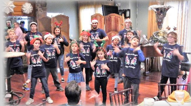
TSD Students Sing Christmas Carols.