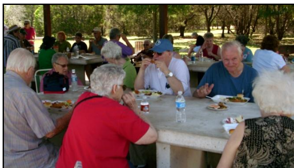
TAD-SC and La Vista with their spouses and friends enjoyed eating and social.